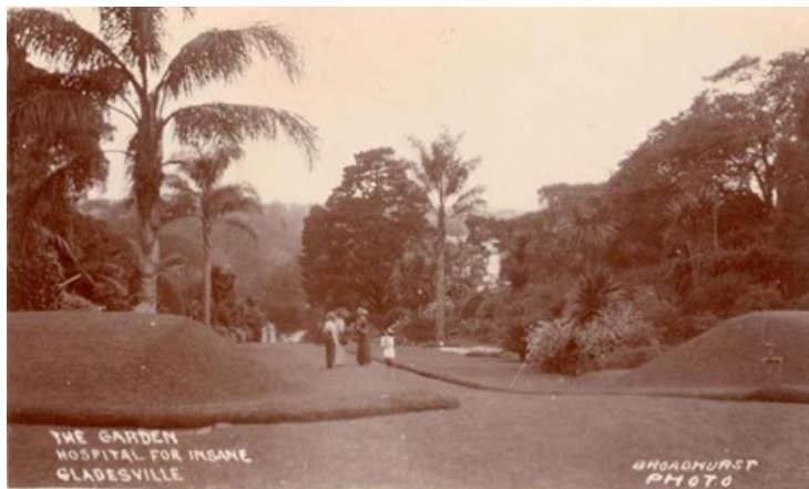
Figure 4 The Garden, Hospital for the Insane, Gladesville, photo: Broadhurst, SLNSWSource AILA Report 2018