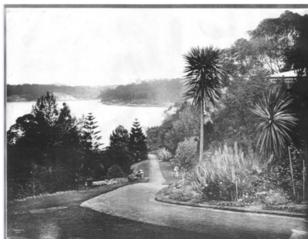
Figure 3 Superintendent's garden to Parramatta River c1890