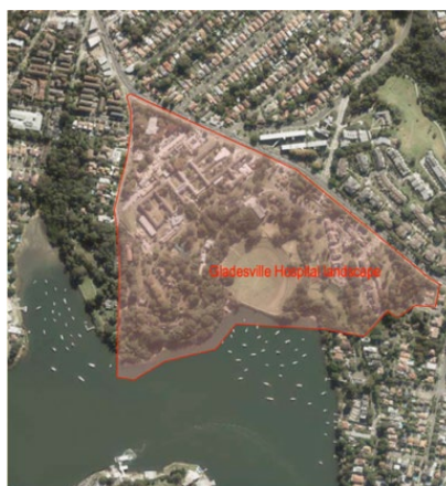
Figure. 1: Proposed curtilage, Gladesville Hospital Landscape, AILA Landscape Heritage nomination for NSW State Heritage, 2018

Gladesville Hospital Landscape is another of the ten nominations lodged in 2018 for State Heritage Listing and progressed to consideration by the Heritage Council NSW.