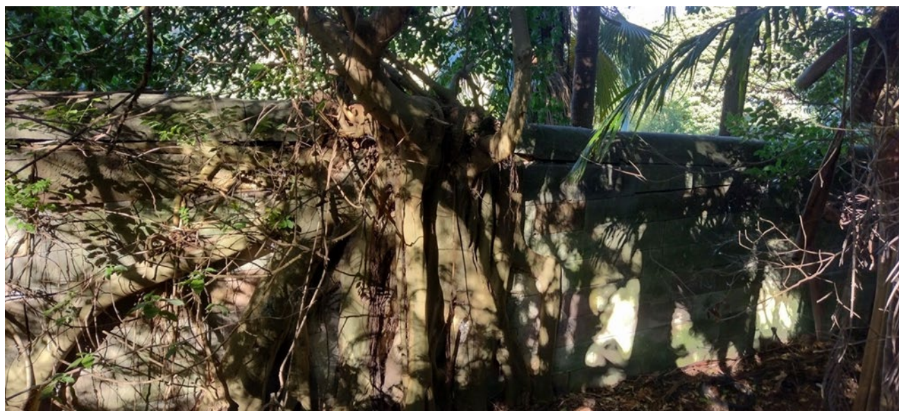
Figure 5 An opportunistic fig seedling destroying sandstone wall.